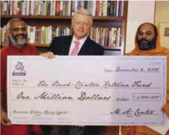
Former U.S. President Bill Clinton receiving a cheque from the M.A. Center, USA.

Following hurricanes Katrina and Rita—which struck the Gulf Area of the United States in August and September 2005, respectively—more than 100 Amma service groups throughout North America responded by giving carloads, vanloads and truckloads of food, clothing, school supplies and other essential items. Extensive medical care and emotional support was given. Volunteers visited relief sites and helped displaced persons locate one another, via the Internet.