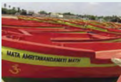
Boats and engines in Tamil Nadu awaiting distribution