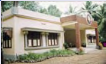
The palliative care home, Trivandrum