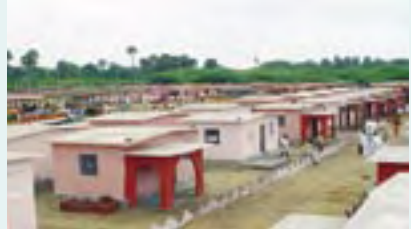
Rameshwaram, Tamil Nadu

Since the Amrita Kuteeram residents no longer need to pay rent, they have more money to buy essentials that previously they had to go without. The local branch ashrams support the Kuteerams in their area by providing informal schooling and helping the adults to find jobs. Amrita Kuteerams are thus instrumental in providing people with a whole new start in life.