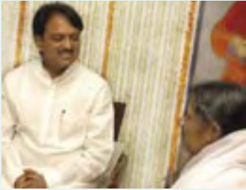
Amma in discussion with Maharashtra Chief Minister, Vilasrao Deshmukh