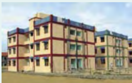
Apartments in Periyaniavanai, Ampara, Sri Lanka