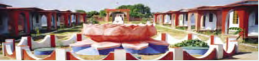
Mirzapur, Uttar Pradesh

For each development, MAM builds a community hall where residents can come together and celebrate festivals and public holidays. State governments throughout India provide the land for MAM to develop.