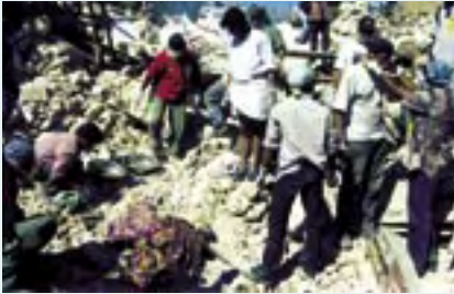
Amrita University students help relief operations