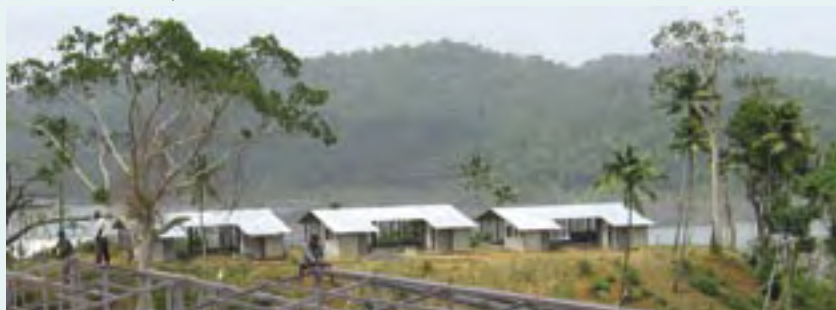
Houses in Bamboo Flat, South Andaman

SOUTH ANDAMAN: Situated about 1,000 kms off the east coast of India, the Andaman and Nicobar Islands bore the brunt of the tsunami. MAM is building 200 homes in Bamboo Flat and Austinabad in South Andaman. As all the building materials, an estimated 1,000 tons, have to be shipped from mainland India, the cost will come to about Rs. 20 crores ($4.8 million U.S.). The houses are duplexes, with each half measuring 500 square-feet, and having an attached bathroom with toilet. The steel-framed structures are earthquake resistant. The houses are scheduled to be completed by March 2008.