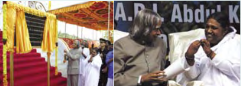
Amma with former President of India, Dr. A.P.J. Kalam at the inauguration of Amrita Setu

“May this bridge not only connect two shores, but remain forever as a symbol of love and brotherhood, uniting human hearts as well.” —Amma