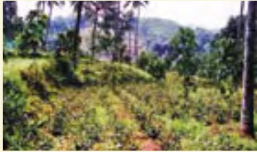
Medicinal Plant Reserve