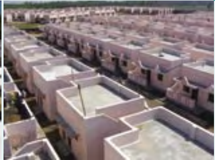
Pudukkupam, Cuddalore, Tamil Nadu

TAMIL NADU: In the districts of Cuddalore, Kanyakumari and Nagapattinam, MAM has built entire colonies, complete with electricity, plumbing, systems of roads, buildings for childcare and other amenities.