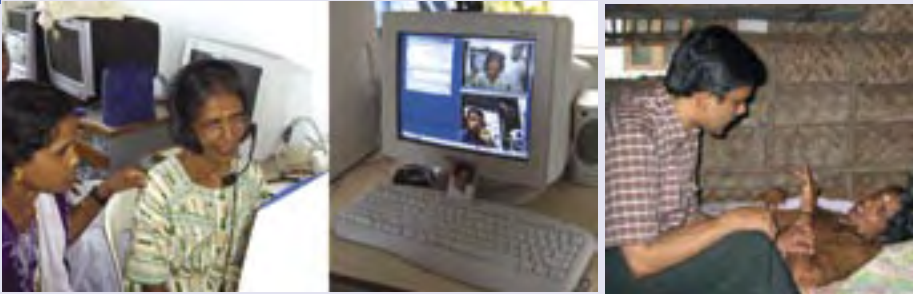
Left to right: Screening of a telemedicine patient; palliative home care