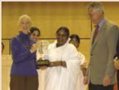
Above: Amma received the 2002 Gandhi-King Award for Non-violence from Dr. Jane Goodall, the previous recipient, in the presence of His Excellency Sergio Vieira de Mello, the late U.N. High Commissioner for Human Rights.

Parliament of the World’s Religions, Barcelona, Spain