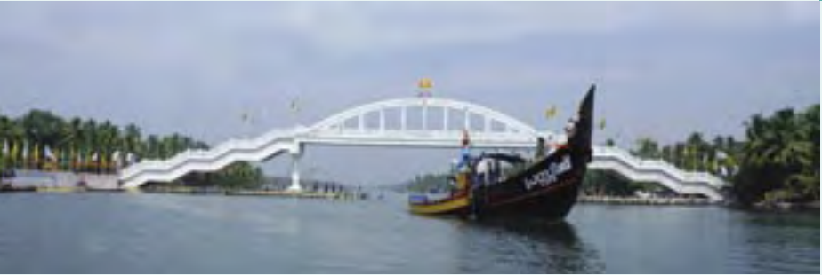
Amrita Setu, the evacuation bridge built over the backwaters of Kerala, by MAM