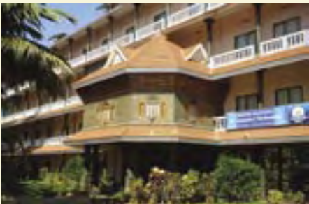
School of Biotechnology, Amritapuri

The School of Biotechnology, with its strong undergraduate and postgraduate programmes in Biotechnology, is recognized as a Department of Science & Technology Mission REACH-TIFAC Centre of Relevance and Excellence in Biomedical Technology. The school has a strong research programme concentrating on preventive and therapeutic innovations. The school offers undergraduate programmes in B.Sc. Biotechnology and B.Sc. Microbiology as well as postgraduate programmes in M.Sc. Biotechnology and M.Sc. Bioinformatics.