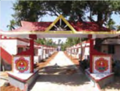
Kanyakumari, Tamil Nadu