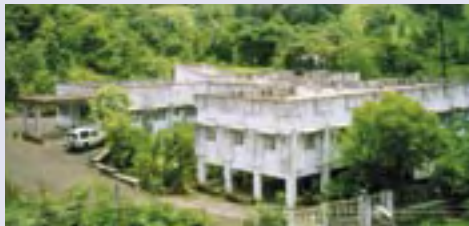
The hospice, Mumbai