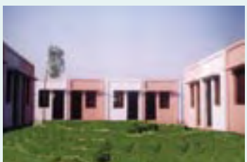
Lucknow, Uttar Pradesh