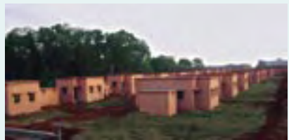
Durgapur, West Bengal