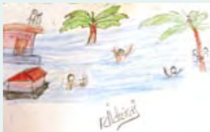
Helping children overcome their fears: (l.) a swimming lesson with Amma and (r.) a picture drawn during a child's therapy session