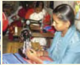
Leather bag fabrication