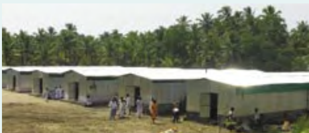
Food serving at the temporary shelters in Kerala.

Within a week of the tragedy, construction of temporary shelters for the homeless began on MAM land. Nine shelters, complete with electricity, ceiling fans and separate bathrooms, were built within a few weeks. In Alappad, Kerala and in Samanthampettai, Tamil Nadu, MAM provided shelter for 550 families. MAM connected its temporary shelters with the AIMS Hospital and the Amritapuri Ashram hospital via a telemedicine satellite link.