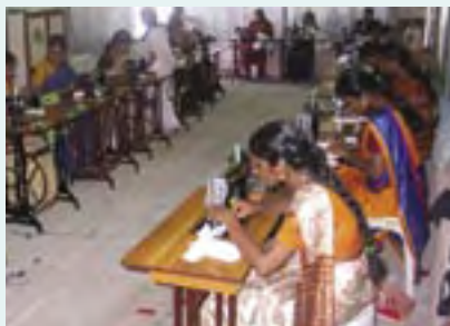
Women training to become tailors in the shelters