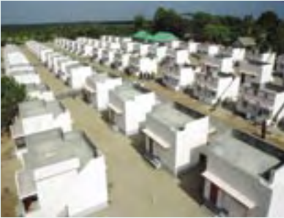
Samanthampettai, Nagapattinam, Tamil Nadu