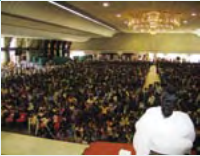
10,000 children participated in the five-day camps