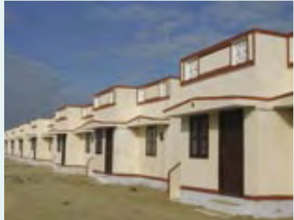
Vadakku Vanchiyoor, Kairakal, Pondicherry