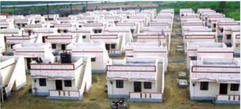
Mela Pattinacherry, Nagapattinam, Tamil Nadu

KERALA: Many of the houses that were constructed along the backwaters or on the islands were inaccessible to supply trucks. Ashram residents and volunteers from around the world helped carry the needed bricks, sand and gravel from supply stations. Houses were constructed in the districts of Kollam, Alappuzha and Ernakulam.