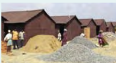
Temporary shelters in Nagapattinam