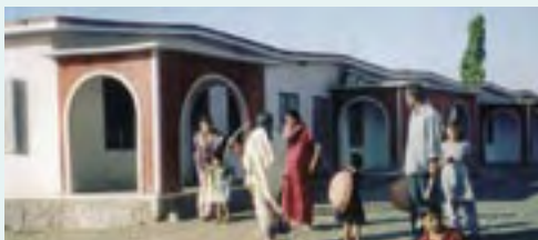
Bhopal, Madhya Pradesh

This vast project is possible thanks to the selfless service of Amma's monastic disciples and volunteers. They not only supervise the construction of the houses but also the building of roads, the provision of electricity, the drilling of bore wells and the installation of water tanks. Houses commonly have two rooms, a verandah and separate bathrooms.