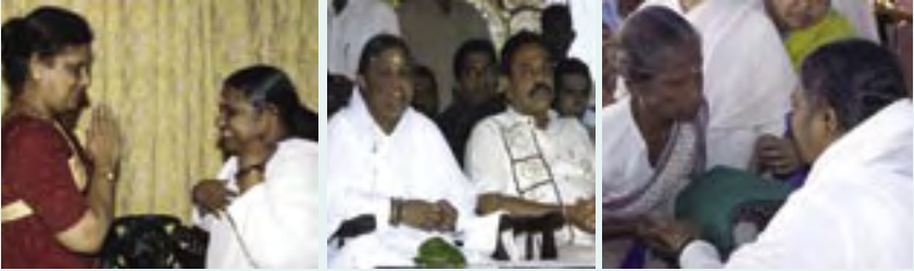
2006, Sri Lanka, Amma met President Chandrika Kumaratunge, P.M. Mahindra Rajapakse and thousands of victims.