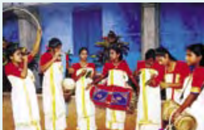
Boys and girls practise panchavadyam music

The children at the orphanage excel in music, sports and dance. They are well-known in their district for their talents in panchavadyam , Kerala's traditional temple music. Though generally taught only to boys, the orphanage also encourages girls to learn this art form. The children also study traditional dance dramas like koodiyattom , poorakkali and kolkali , as well as musical instruments like the veena and tabla . In state and local cultural competitions, the children often win first prize.