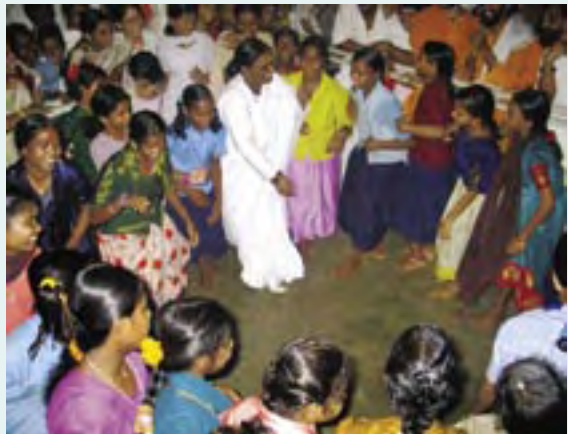
Amma joins the children's tribal dance

During the school holidays, many of the children visit Amma's Ashram and join in the daily activities. They have developed a strong, lasting relationship with Amma and say that they feel she is their own mother.