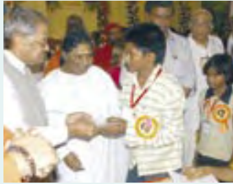
Amma presents scholarships to children from Andhra Pradesh & Karnataka