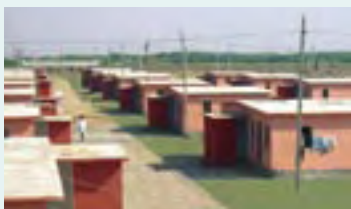
Cuddapah, Andhra Pradesh