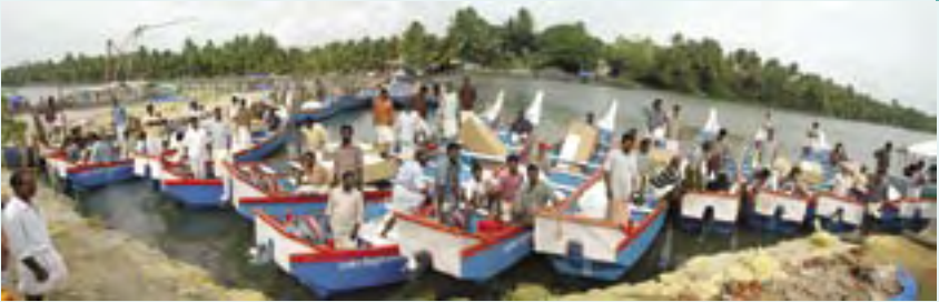
Giving boats to fishermen in Kerala