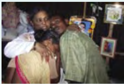
Amma comforts a family in their temporary shelter

In February 2005 Amma visited the region and the families in MAM's temporary shelters. Thousands came to her, still wracked in distress. She lovingly reassured them and calmed their fears about living next to the sea.