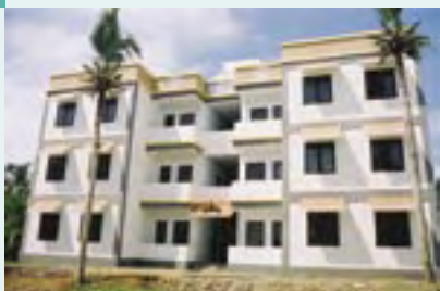
Apartments in Thekkawatta, Kalutara, Sri Lanka