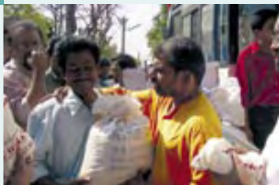
Providing food and solace in Nagapattinam