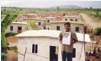
Satyamanagalam, Tamil Nadu