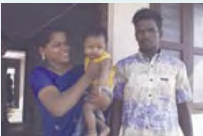
A family in their new home in Samanthampettai, Tamil Nadu

Within the first three months after the tsunami struck, more than 20,000 volunteers, including ashram residents from India and abroad, students and members of MAM’s youth wing helped with the relief work.