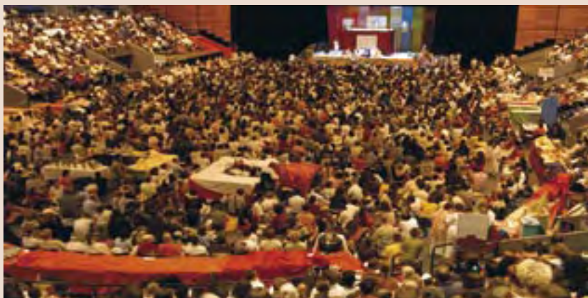
Amma in Toulon, France

Amma travels constantly throughout the world. Everywhere she goes, huge crowds gather to hear her speak, to receive her loving embrace (darshan) or simply to be in her presence. Year after year, Amma returns to her children, in all parts of the world, encouraging them in their efforts to imbibe her message of love and service to others.