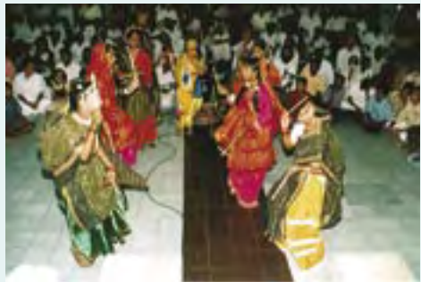
Children receiving certificates from award-winning actor Nedumudi Venu; Children from Alappuzha act and dance