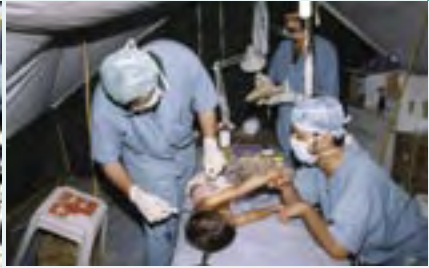
AIMS hospital surgeons perform an operation in a tent