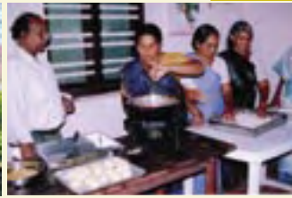
Fish food processing